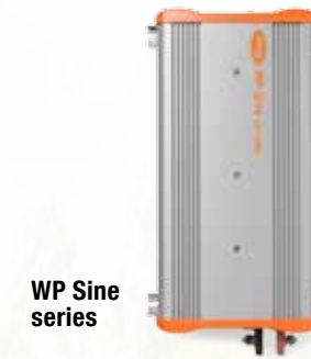
WP Sine series