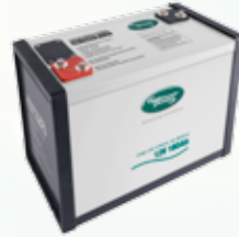
ION Power Plus