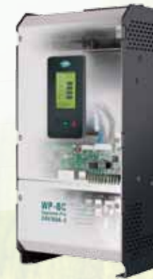
Supreme Pro Series