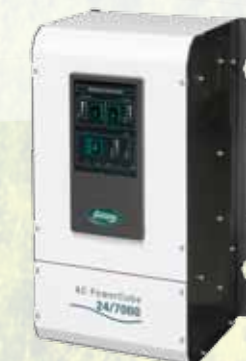
AC PowerCube Series