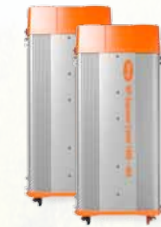
Supreme Combi Series