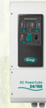
DC PowerCube Series