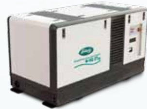
SC & SQ models

Fixed RPM range -3000/1500 rpm - 6 - 54 kVA