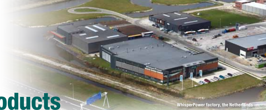
WhisperPower factory, the Netherlands

Can be delivered in parts as a modular system