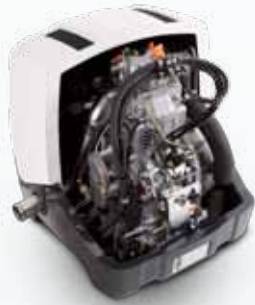
Piccolo & Scalino Series